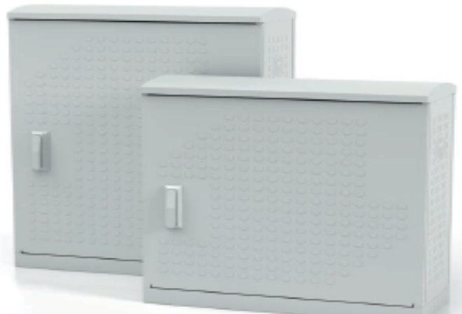
Size 1 , 1100/850mm High