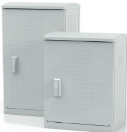
Size 00 , 1100/850mm High