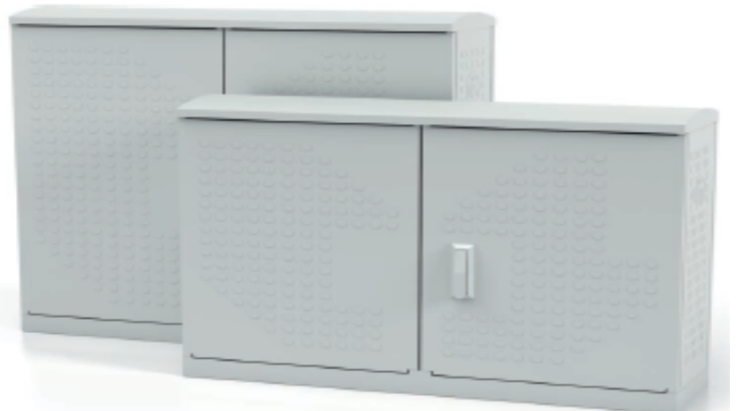
Size 2 , 1100/850 High