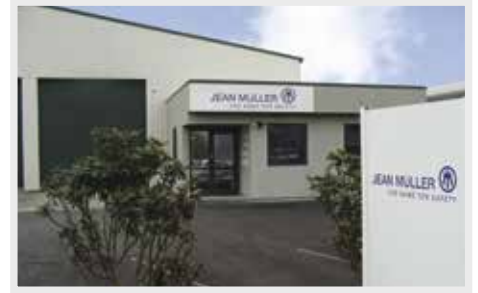
Jean Muller NZ Ltd. Taranaki, New Zealand.

With our specialist knowledge of local electrical supply industries and backed by more than 100 years of German expertise and innovation, you're in safe hands with Jean Muller.