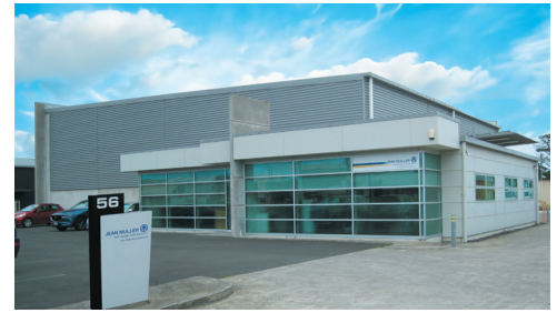
Jean Muller NZ Ltd. Taranaki, New Zealand.

With our specialist knowledge of local electrical supply industries and backed by more than 100 years of German expertise and innovation, you're in safe hands with Jean Muller.